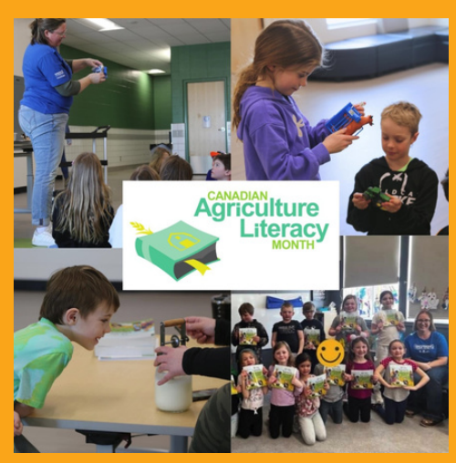
7,271 students, 320 classrooms, 192 schools and 153 volunteers